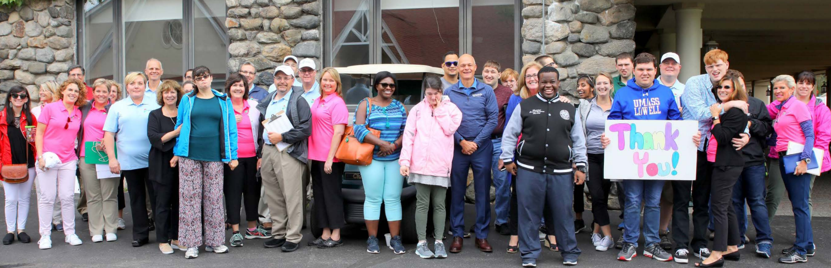
Melmark New England staff and students send off golfers at the 13 th Annual fore Melmark New England Golf Tournament with many thanks.