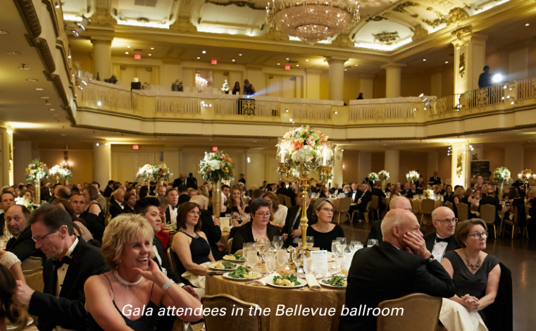
Gala attendees in the Bellevue ballroom