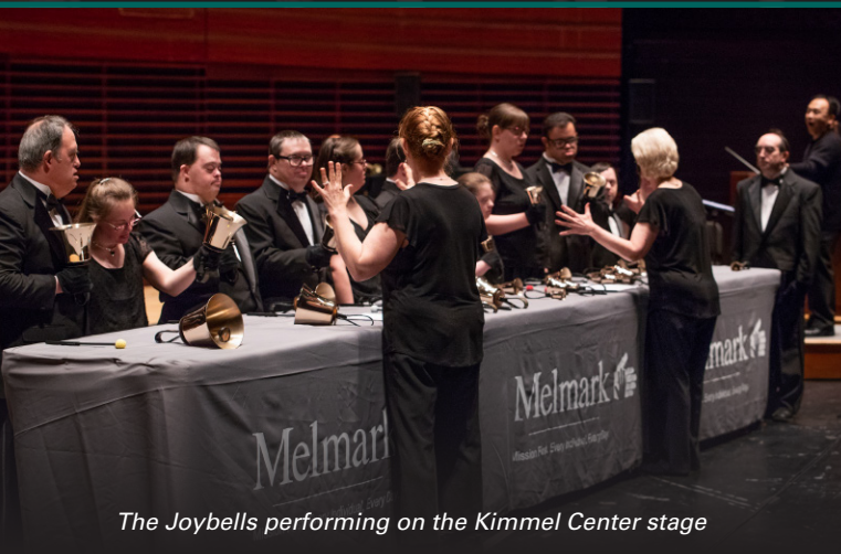
The Joybells performing on the Kimmel Center stage