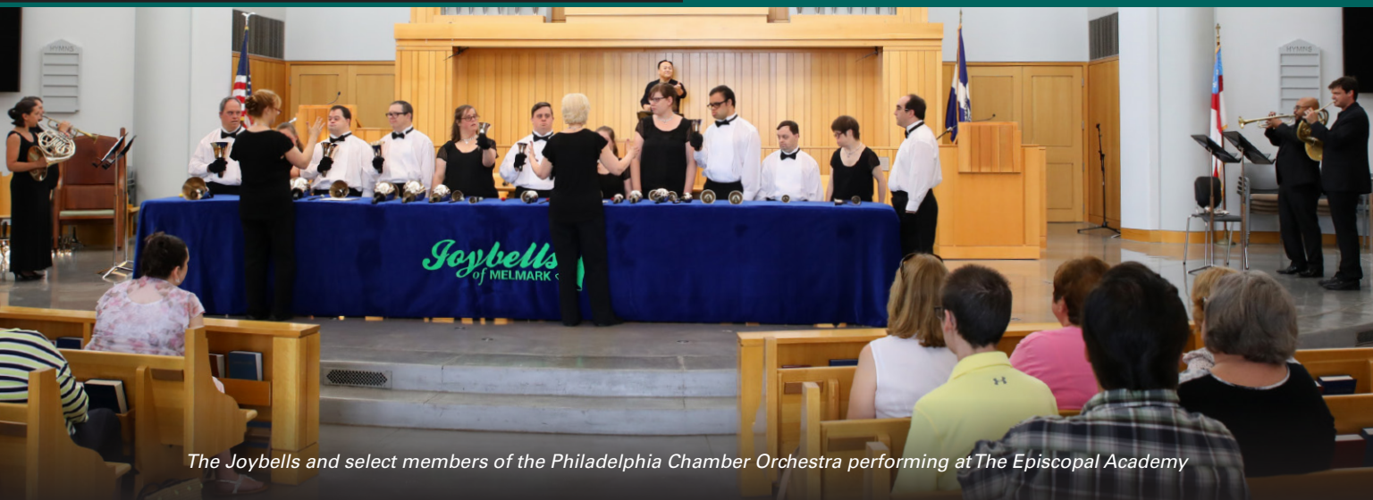
The Joybells and select members of the Philadelphia Chamber Orchestra performing at The Episcopal Academy