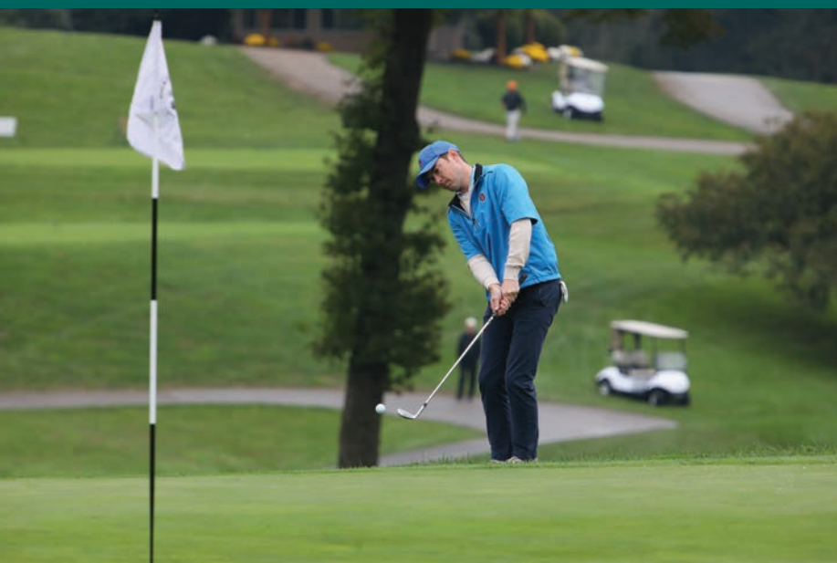
A golfer chips on the green.