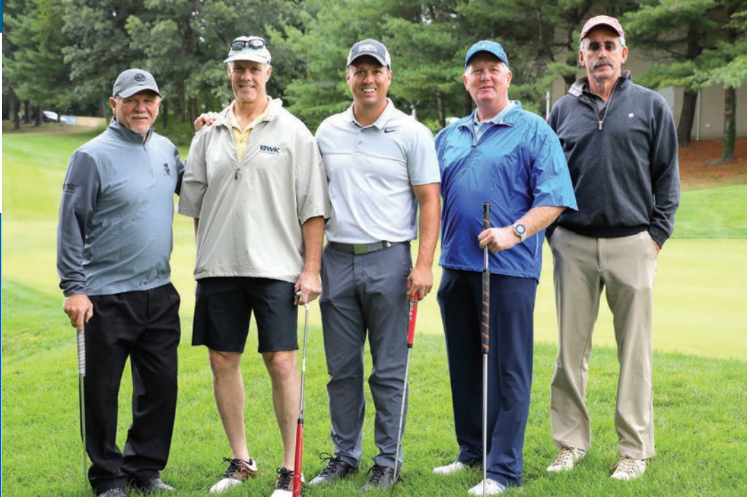
Congratulations to our winning team from BWK Construction! They were thrilled to have famed Boston Bruins alum, Rick Middleton, join them this year.