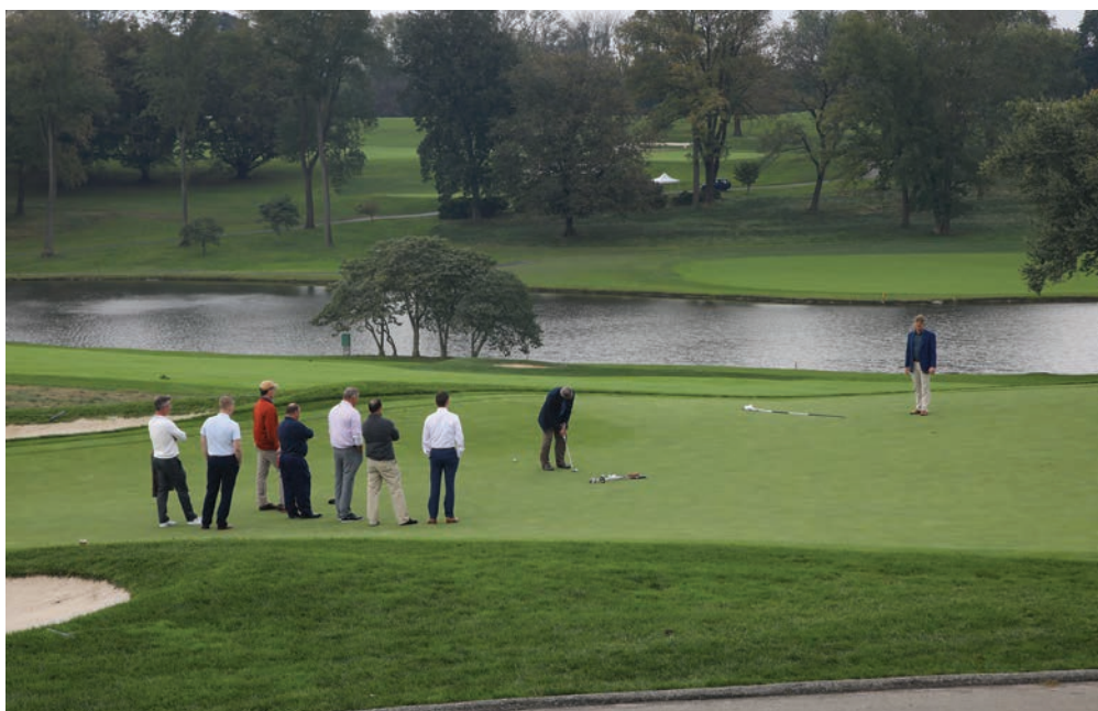
Participants lined up before the evening festivities for the putting contest.