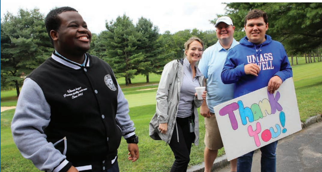
Melmark students and staff cheer on the golfers as they hit the links.