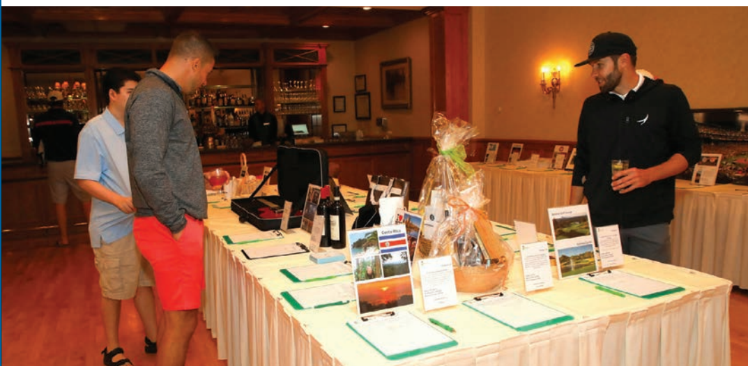
Perusing the Silent Auction offerings before dinner.